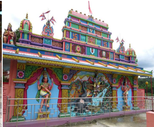
Gajendra Moksha Dham

There is another holy place nearby Valimiki Ashram called Gajendra Moskhya Dham. It is located on the bank of Narayani (Gandak) River nearby Triveni Dham. According to the Vishnu Purana, Lord Vishnu saved the Gaja, an elephant from the Graha, a crocodile while they were wrestling for a life.