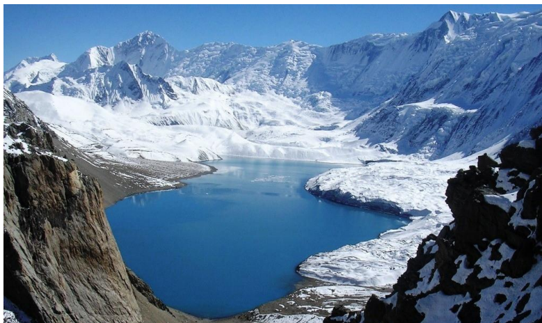
Kagbhusundi Lake (4,949m)